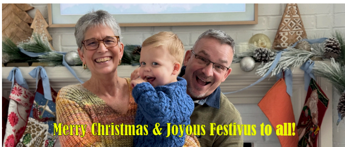
Merry Christmas & Joyous Festivus to all!